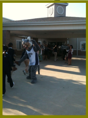
The Wildcat meets and greets!

Walton welcomed over 750 students on September 7th, 2010, on a beautiful fall morning. Despite the construction taking place on Walton Boulevard, students arrived on time and ready for their first full day of learning. Teachers waited outside with their names on signs to attract their new students and families. After teacher introductions, classes rushed outside only to re-enter the building for an energy filled assembly. At the front doors support staff and the leadership team greeted all Wildcat grade levels K-8 in a pompom filled entrance leading to the gymnasium. This particular morning was truly motivating and an awesome experience for all.